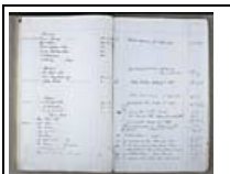
Job book: 53059 Page: 216