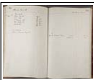
Job book: 53061 Page: 161