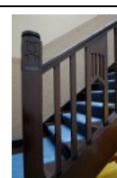
Detail of Session house stair