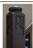
Newel post of Session house stair