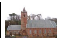
View from W., showing church of 1855-6, left of tower