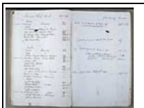
Job book: 53059 Page: 214

The following information about M064 has been extracted from the job books: