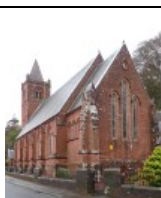
View from S.W.