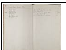
Job book: 53061 Page: 17