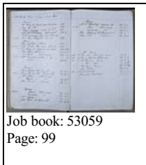
Job book: 53059 Page: 99

The following information about M013 has been extracted from the job books: