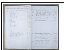
Job book: 53059 Page: 103

The following information about M016 has been extracted from the job books: