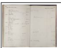
Job book: 53061 Page: 81