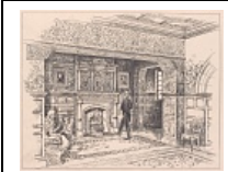
Drawing of dining room alcove, British Architect, 11 September 1891, p. 197