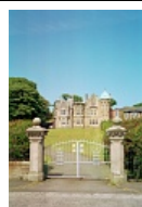
Dunloe, S. elevation