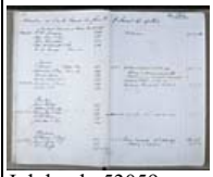
Job book: 53059 Page: 121