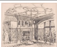
Drawing of hall chimneypiece, British Architect, 18 September 1891, p. 212