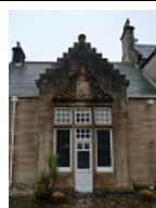
W. elevation, billiard-room door