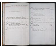
Job book: 53062 Page: 13