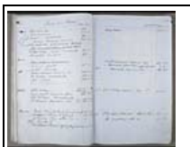
Job book: 53059 Page: 143