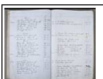
Job book: 53059 Page: 154