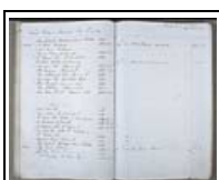
Job book: 53059 Page: 152

The following information about M053 has been extracted from the job books: