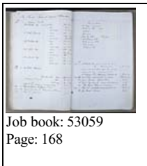
Job book: 53059 Page: 168

The following information about M058 has been extracted from the job books: