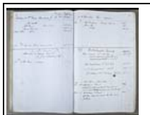
Job book: 53059 Page: 160

The following information about M074 has been extracted from the job books: