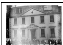
42 Miller Street, 1909