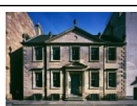
42 Miller Street