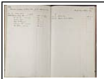
Job book: 53061 Page: 109

Client: James McMichael & Son; Gordon & Arnott