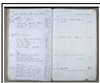
Job book: 53059 Page: 208

The following information about M076 has been extracted from the job books: