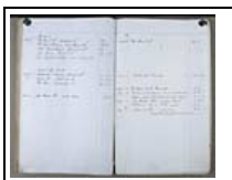
Job book: 53059 Page: 210