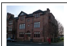
N. and W. elevations