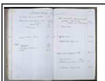
Job book: 53059 Page: 254

The following information about M095 has been extracted from the job books: