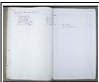
Job book: 53059 Page: 242