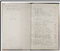
Job book: 53061 Page: 41