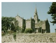
View from S.E., 1979