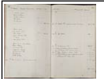
Job book: 53061 Page: 87

The following information about M128 has been extracted from the job books: