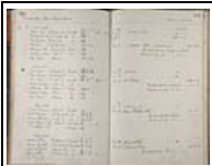
Job book: 53061 Page: 183