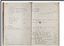
Job book: 53061 Page: 185