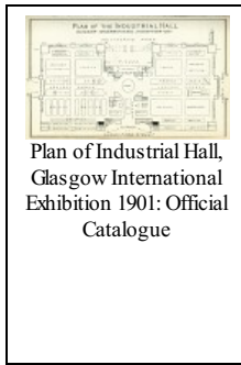
Plan of Industrial Hall, Glasgow International Exhibition 1901: Official Catalogue