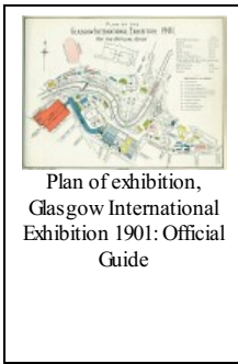
Plan of exhibition, Glasgow International Exhibition 1901: Official Guide