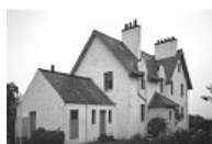
View from E., 1975-6