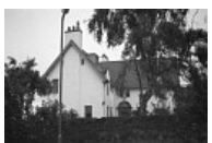
View from W., 1975-6