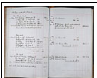
Job book: 53062 Page: 56