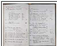
Job book: 53062 Page: 57