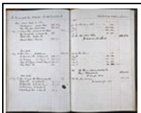
Job book: 53062 Page: 55

The following information about M226 has been extracted from the job books: