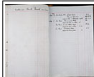
Job book: 53062 Page: 94