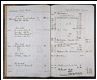
Job book: 53062 Page: 17