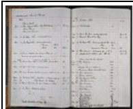
Job book: 53062 Page: 18