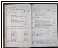
Job book: 53062 Page: 25