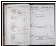
Job book: 53062 Page: 23

The following information about M231 has been extracted from the job books: