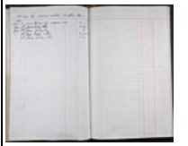
Job book: 53062 Page: 87

The following information about M252 has been extracted from the job books: