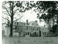
Garden elevation, with Mackintosh extension on right, 1957