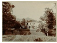
Entrance front before extension, 1907