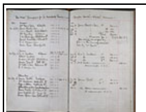
Job book: 53062 Page: 127

The following information about M276 has been extracted from the job books: