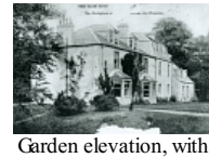
Garden elevation, with Mackintosh extension on right, before 1968