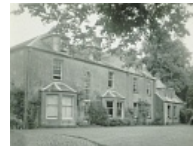
Garden elevation, with Mackintosh extension on right, before 1968