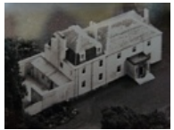
Aerial view after partial demolition, c. 1968