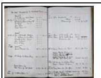
Job book: 53062 Page: 128