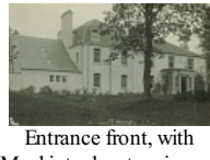
Entrance front, with Mackintosh extension on left, before 1968