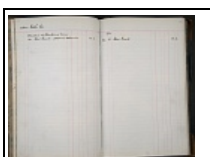
Job book: 53063 Page: 42