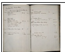
Job book: 53063 Page: 101

Phase 2: Dormer windows and alterations at bathroom, 1913–14