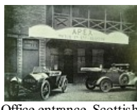
Office entrance, Scottish Country Life, June 1916, pp. 258-9