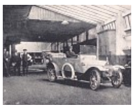
Covered yard, Scottish Country Life, June 1916, pp. 258-9