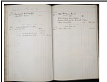
Job book: 53063 Page: 45