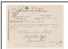
City of Glasgow Master of Works certificate for plumbing and drainage at 354 Dumbarton Road, 22 November 1912