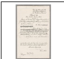
City of Glasgow Master of Works inspection certificate for 354 Dumbarton Road, 15 November 1912